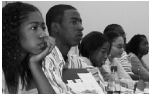
Students eager to improve their ACT scores attend an MC-sponsored workshop on how to do just that.