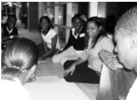
Memphis Challenge orientation activity