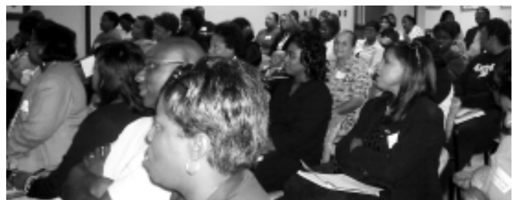
Parents attend orientation to find out more about the benefits of the program.