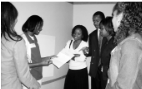
MC Class of 2006 students learn a little about each other at orientation.